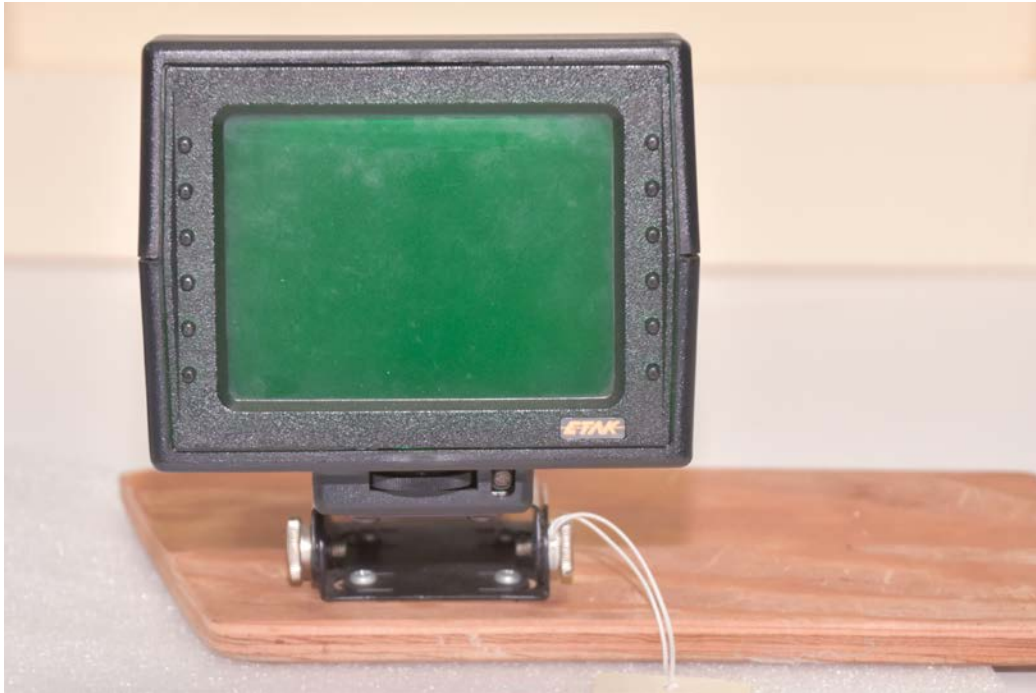
Graphic Display Unit