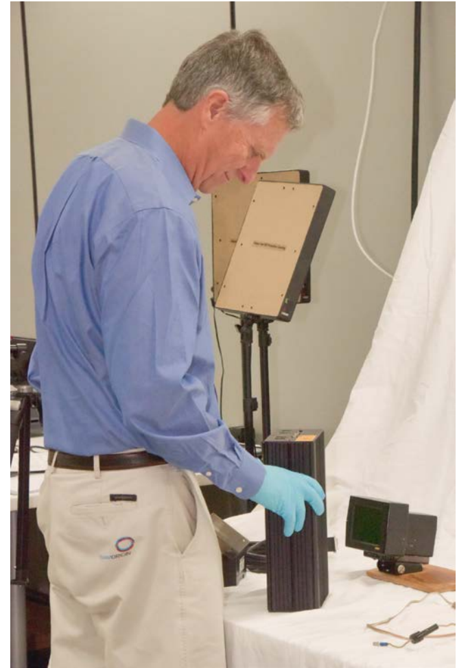
Taking a screwdriver to an official CHM artifact is discouraged, but under the circumstances ...