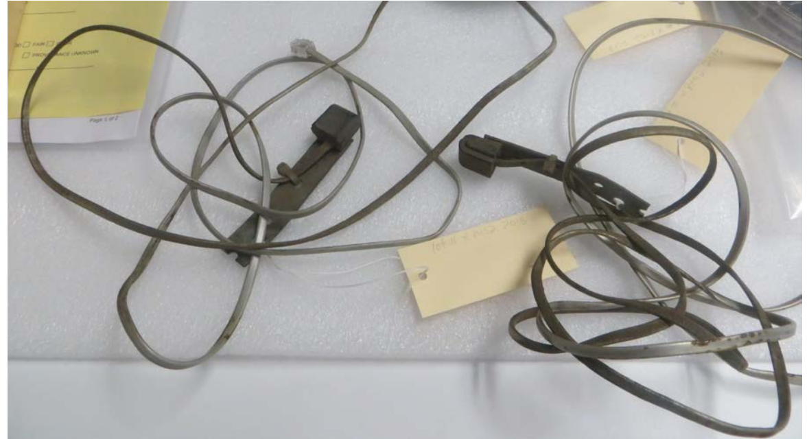
Rear Wheel Rotation Sensors