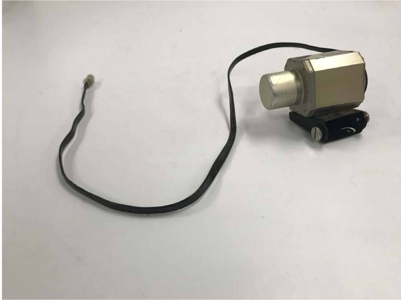
Gyroscope considered but not used in final ETAK design.