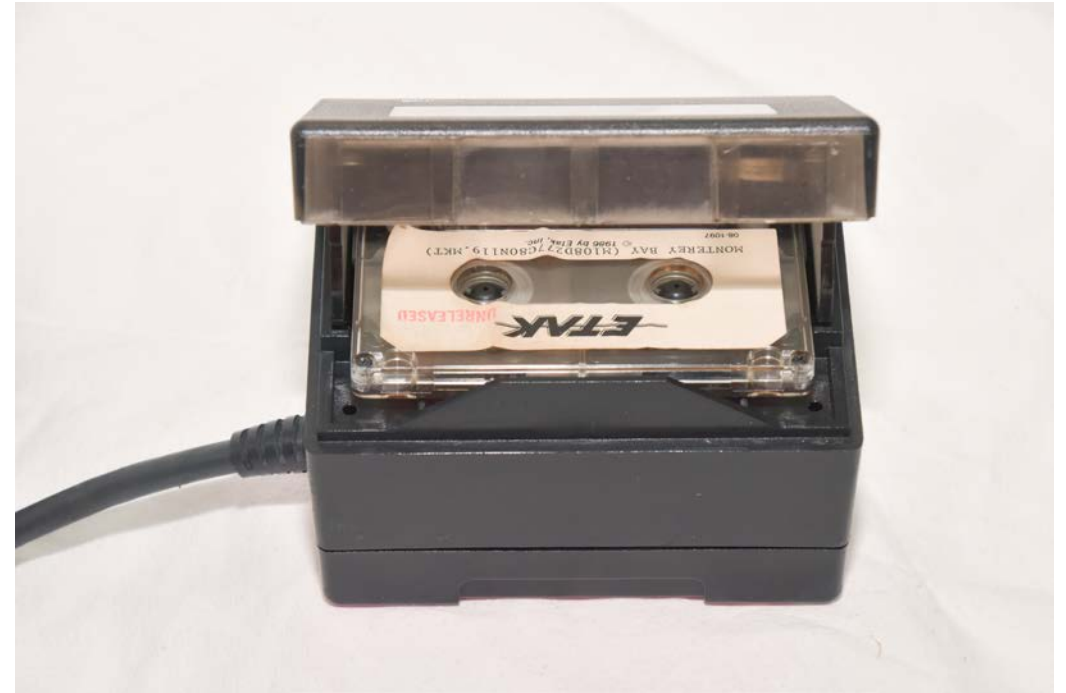
Map Cassette Tape Unit