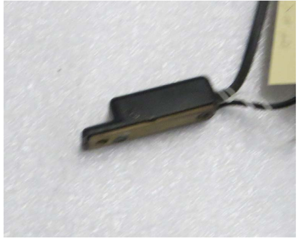
Heater Motor Magnetic Sensor