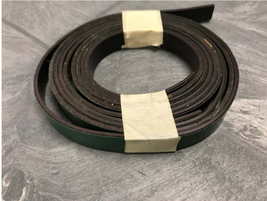
Magnetic Tape Installed Inside Rear Wheel Rims